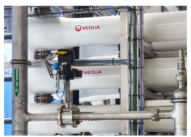
One DN 125 and one DN50 slide gate valve are used in each of the twelve reverse osmosis units.

"The long service lives of the sliding gate valves were also a decisive point. These result, among other things, from the fact that they neutralise the damaging effects of cavitation", says Lejeune. In alternative globe valves, imploding cavitation bubbles often cause cost-intensive wear due to erosion. "Due to the special design of the sliding gate valves without flow deflection, the cavitation bubbles implode 1-2 m behind the valve in the pipeline. This can easily be designed so that no damaging effect arises from the cavitation. For this purpose, it is sufficient to run the pipe straight for a short distance after the valve", adds