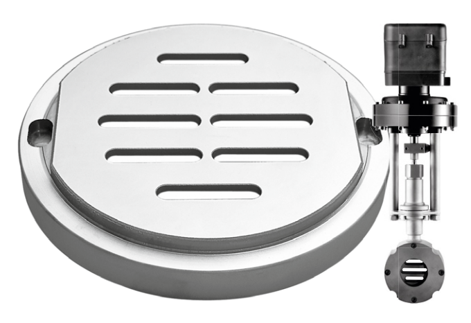
The slotted plates sliding against each other form the main throttling element in sliding gate valves. Since metal seats can be dispensed with in this system, scoring is eliminated which, in conventional valves, results very rapidly in expensive leaking.

decision criteria for Eichbaum in placing their reliance on these valves for the mash house and the filter cellar. Thus, this ease of handling the sliding gate valve was a decisive and cost-reducing benefit not only for installation but also for maintenance.